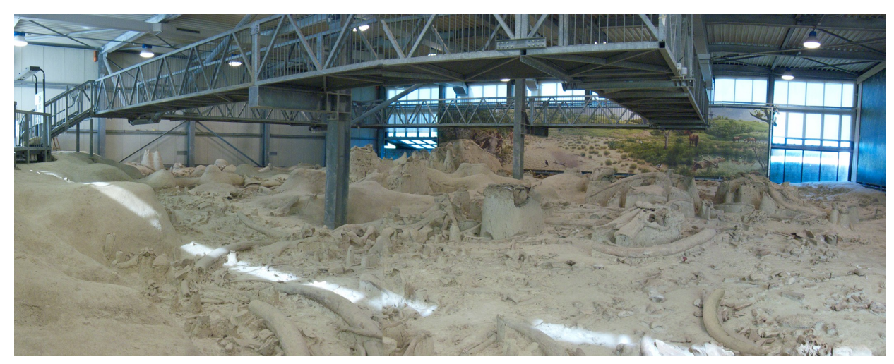
Fig. 1 - Overview on the museum's showcase of the site, seen by SE.

surface of the river-bed with a distribution that reflects the current flow characteristics. For example, in some areas the long and narrow skeletal elements, such as the elephant's tusks, were arranged parallel or transversely to the water flow direction and constituted a barrier that favored the accumulation of other elements.