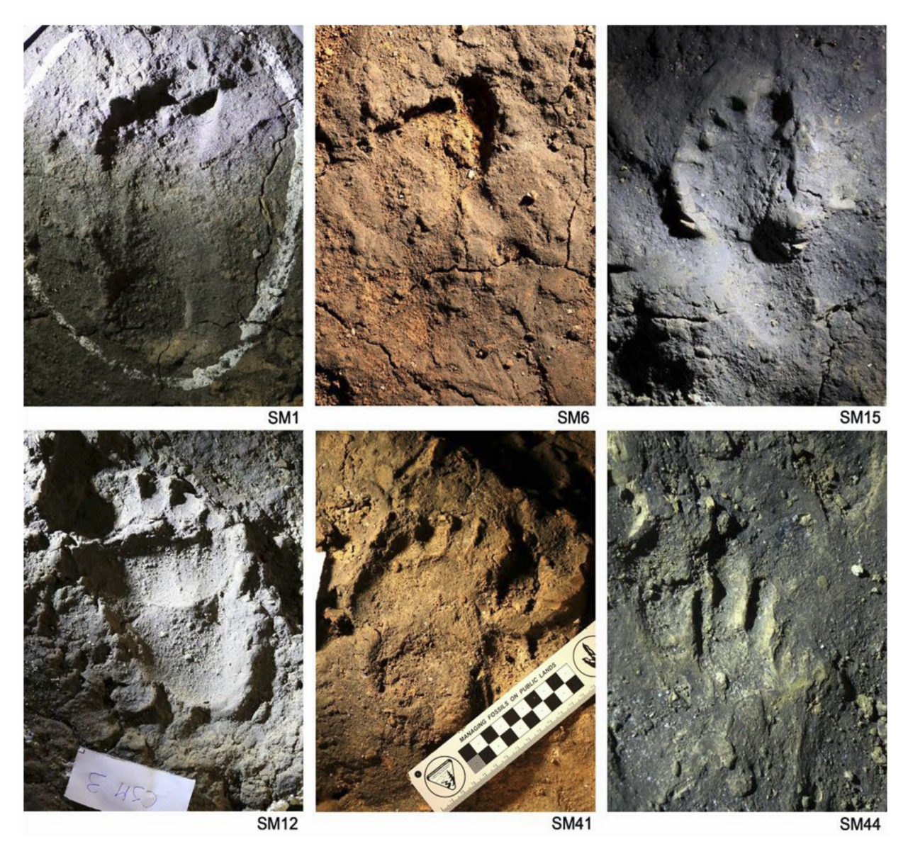
Fig. 1 - Human footprints, bear footprints and human traces preserved in the 'Sala dei Misteri' in the Grotta della Basura SM1, SM6, SM15 human footprints; SM12 adult bear footprint; SM41 immature bear footprint; SM44 human finger traces.

double-checked, using photos and photogrammetric models. The measurements of human footprints are based on both the landmark proposed by Robbins (1985), and on studies following the forensics medicine methods. For all the studied footprints, a photogrammetric model was obtained using photos taken with a 24 Megapixel Canon EOS 750D (18 mm focal length). The software used to build the models in this paper is Agisoft PhotoScan Pro, (www.agisoft.com), among the most user-friendly programs for photogrammetry' (Mallison and Wings, 2014). The accuracy of the obtained models is up to 1 mm for close-range photography (Fig. 2).