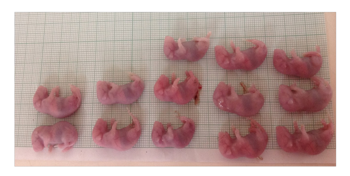
Figure 1 Normal live fetus (without abnormalities) from group 1 (control)

External morphological abnormalities were not found in the control group. However, in the treatment groups (2 and 3) there was a tendency towards external morphological abnormalities. The abnormalities were hemorrhage on the head, face, neck, back, forelimb, hindlimb, and the presence of microcephaly.