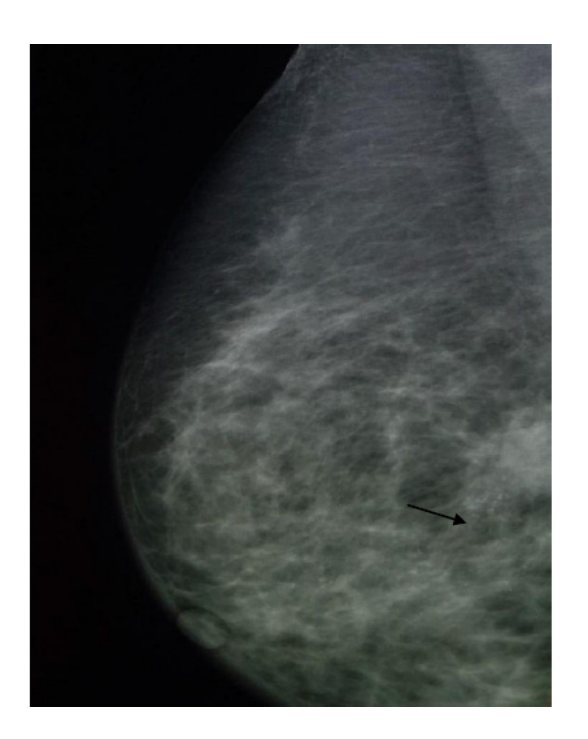
Figure 1 Mammogram (RMLO) Showing Microcalcifications (Arrow)