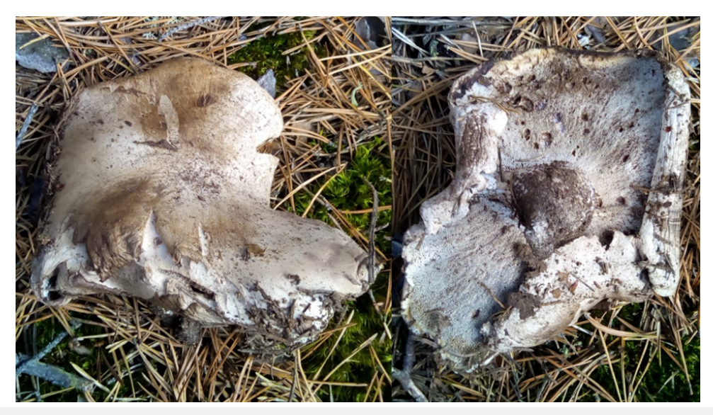
Figure 2 Boletopsis grisea, a species under strict legal protection in Poland.