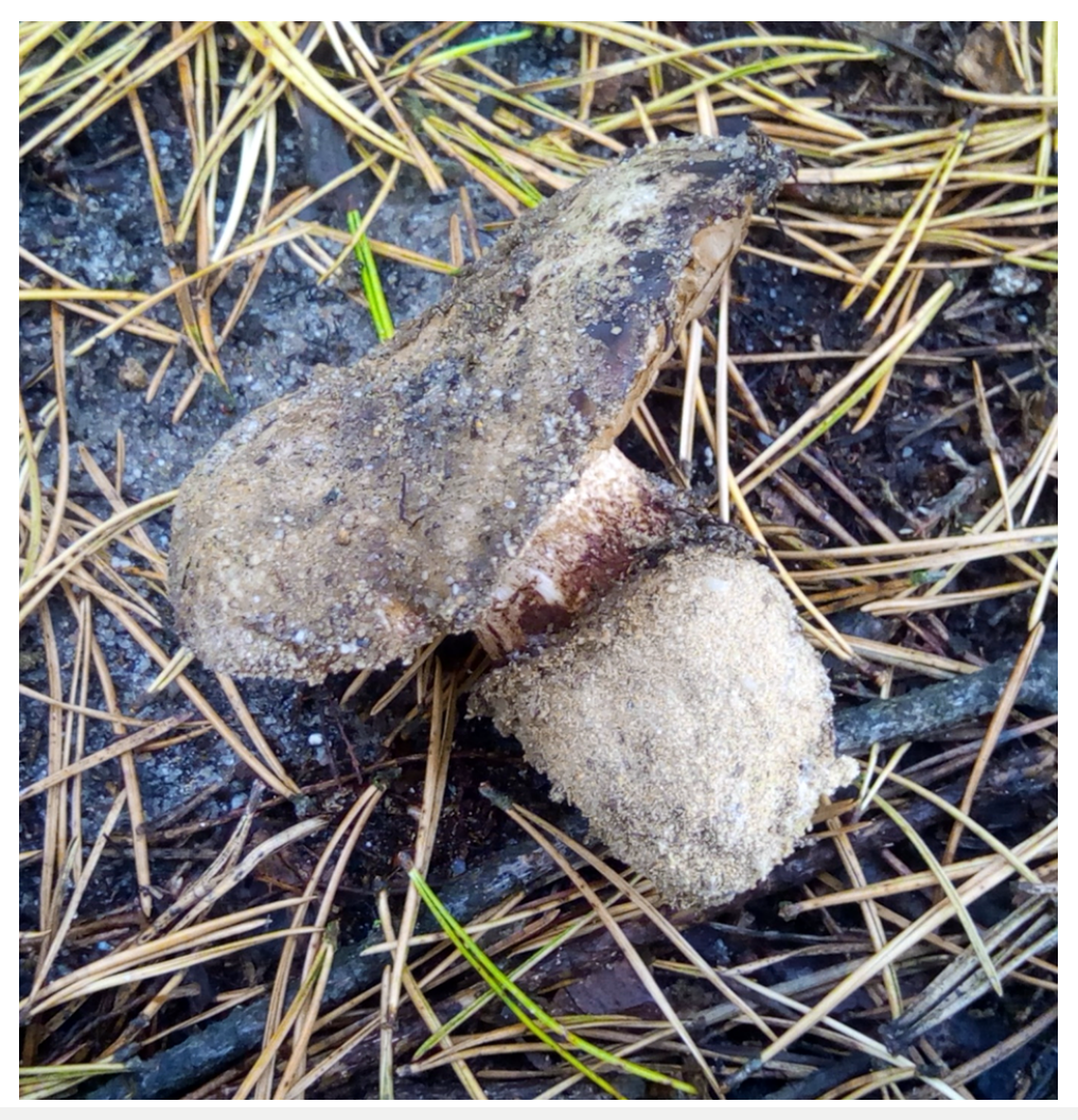
Figure 3 Tricholoma colossus , a species on the red list in category E (endangered).