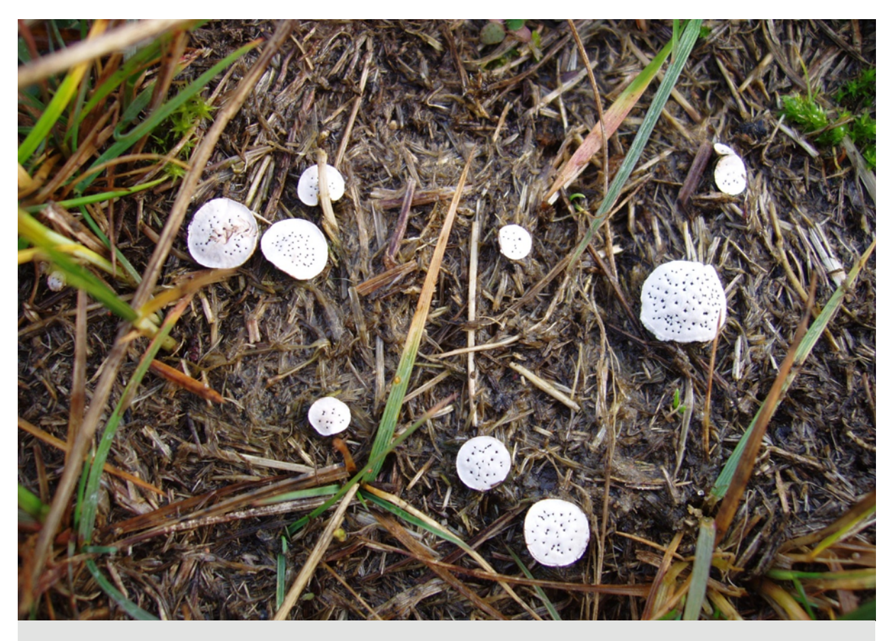
Fig. 1 Stromata of the Poronia punctata (L.: Fr.) Rabenh. (photo by A. Szczepkowski, 2010).

Specimens examined. WAML 835, (Fig. 1); WA 0000051540.