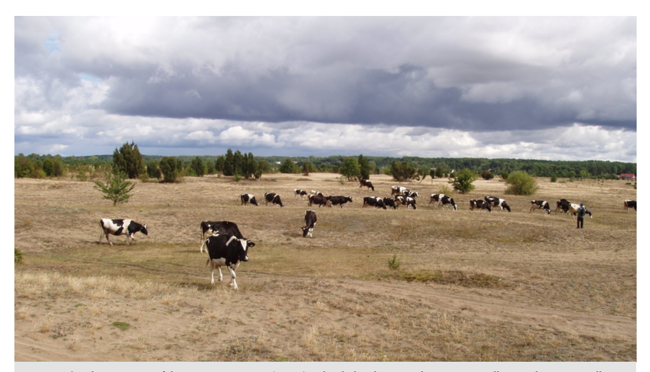
Fig. 3 The physiognomy of the Poronia punctata (L.: Fr.) Rabenh. locality near the Czartoria village in the Narew valley, in Podlasie.

elongatae Krausch 1959 (from the Koehlerio glauce-Corynephoretea canescentis Klika class in Klika et Novak 1941). The main building species are such grasses as: Agrostis capillaris L., Festuca ovina L., and Poa pratensis L. The contribution of Hieracium pilosella L., Achillea millefolium L., Leontodon autumnalis L., Galium verum L., Sedum acre L. is also important. The species Thymus serpyllum L. em. Fr., Armeria maritima (Mill.) Willd. subsp. elongata (Hoffm.) Bonnier, Dianthus deltoides L. and D. carthusianorum L., Potentilla argentea L., Hypochoeris radicata L., Cirsium vulgare (Savi) Ten. as well as a range of others are present constantly and in small density. In the shrub layer, there sporadically occur Rosa sp., Pyrus pyraster (L.) Burgsd., and Juniperus communis L.