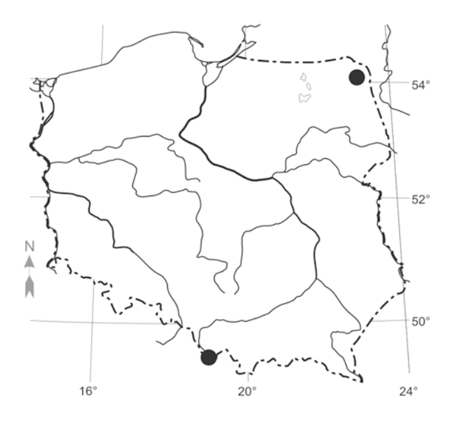
Fig. 1 Localities of Callistosporium pinicola Arnolds (circle) in Poland.

The main aim of this paper is to describe morphologically the first collections of C. pinicola for Poland, and to compare their characters with published data. Furthermore, this paper aims to evaluate its ecology and distribution in Poland (Fig. 1) in regard to the previous records in Europe.