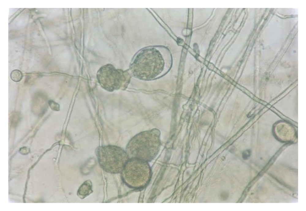
Fig. 2. Zoosporangia of Phytophthora cinnamomi and released zoospores. Phot. G. Szkuta.