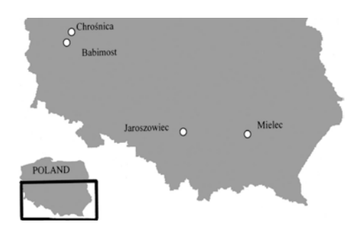
Fig. 1. Map of sampling sites: Chrośnica (15°59'36"N, 52°17'13"E); Babimost (15°50'33"N, 52°09'11"E), Jaroszowiec (19° 36'45"N, 50°20'18"E), Mielec (21° 29'36"N, 50°18'53"E).