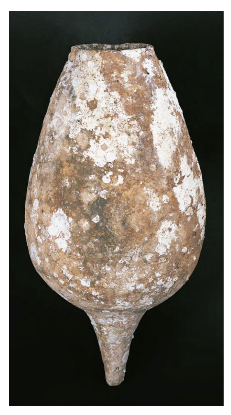
Figure 4: Unglazed earthenware transport container, a so-called torpedo jar, from the Belitung wreck. Manufactured in central Iraq or southern Iran, recovered from a wreck of the first quarter of the ninth century. Height: 113 cm. (From Belitung Wreck, cat. no. 294)

Analysis of the bitumen used to render the interior of these earthenware jars impermeable has confirmed their manufacture across southern Iraq and Iran.