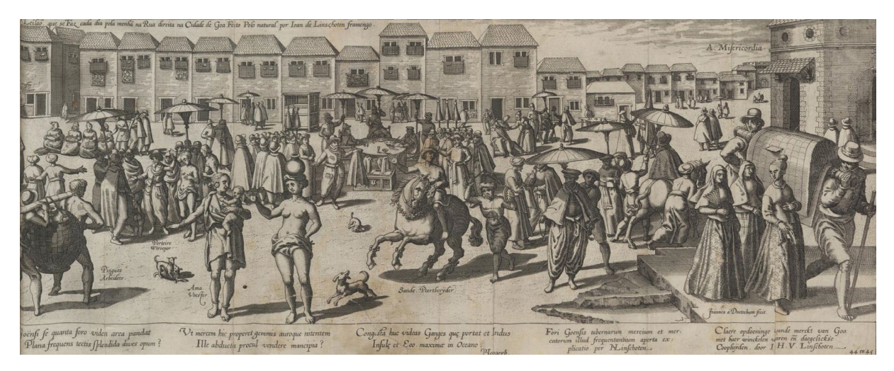
Figure 5: View of the marketplace at Goa from Jan Huygen van Linschoten, Itinerario (1605), showing, on the far left, a large East Asian storage jar transported on a pole.

probably a martaban jar, is encased in a basketry cover, which is then suspended from a bamboo pole (Fig. 5). As the sedan chair shown on the right of the market scene reminds us, this type of carrying method was common also for human transportation. The use of a pole has also been documented ethnographically in Burma in the manufacture of large martaban jars.<sup>61</sup> Using this technology, workers at ports and emporia would have been able to transport and load filled torpedo jars with minimal infrastructure. However, torpedo jars remain noticeably larger than Classical amphorae and thus more complex to handle and move when filled. Their size begs the question how effective the largest jars were in commercial contexts and whether their size responded to other functions—namely, the transport and storage of provisions, including water.