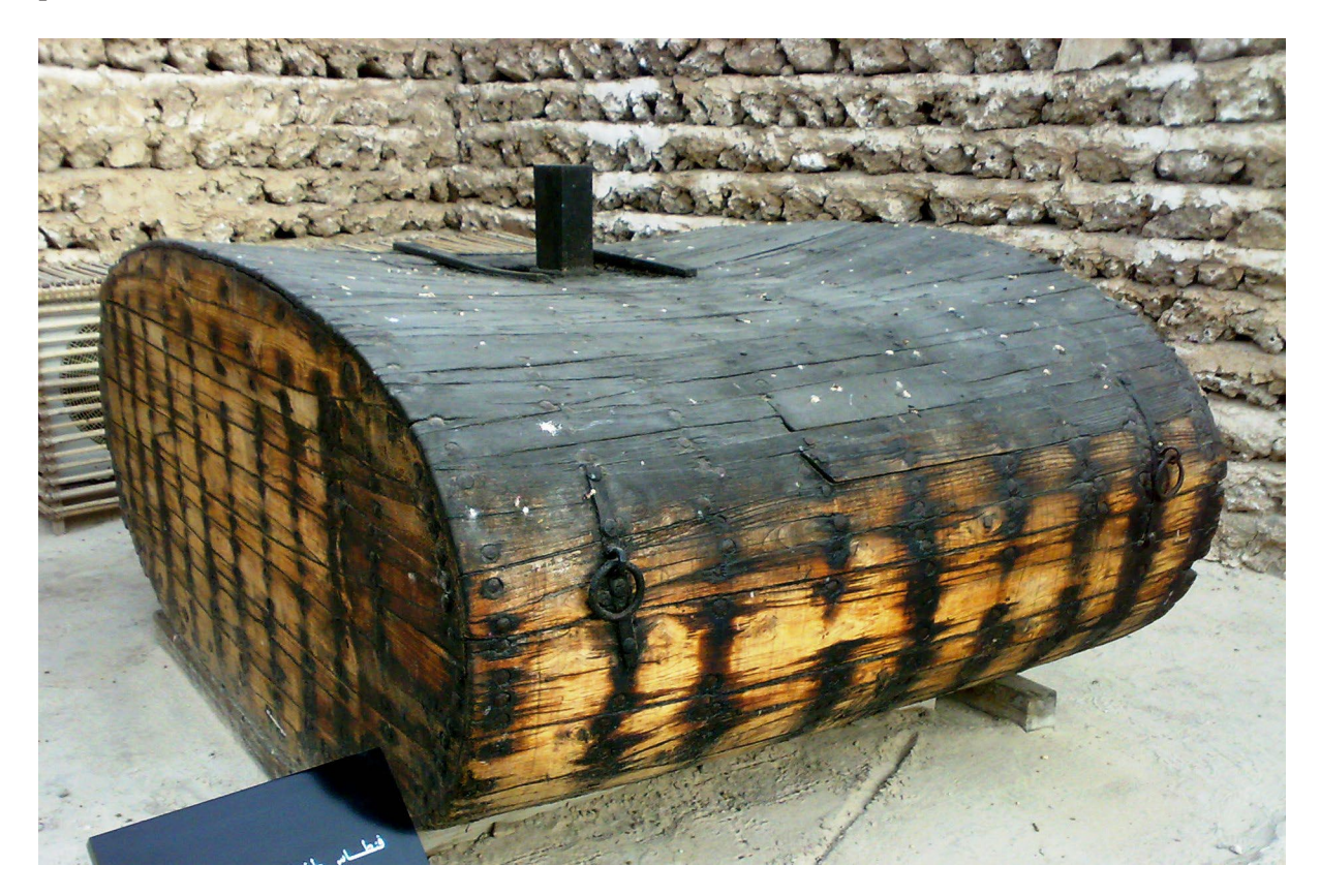
Figure 2: A traditional Arabian ship's tank ( fint\bar{f}as ), wood and iron, capacity unknown. Probably nineteenth century, Dubai Museum (Al Fahidi Fort), United Arab Emirates.

waterskins. As the French merchant Pyrard de Laval noted in the early seventeenth century in a comparison of inbuilt water tanks with European barrels, tanks were "able to hold much more water than our barrels ( pipes ), and do not take up as much space."<sup>43</sup> Tanks have been attested in the Mediterranean from Roman times and continued to be used in Byzantine ships.<sup>44</sup> However, storage of large quantities of water in a single tank left the whole supply vulnerable; the water might become contaminated, a leak might develop, or the ship might be damaged and the entire supply become compromised. By contrast, single containers provided better odds that in the case of a disaster some containers would remain intact.