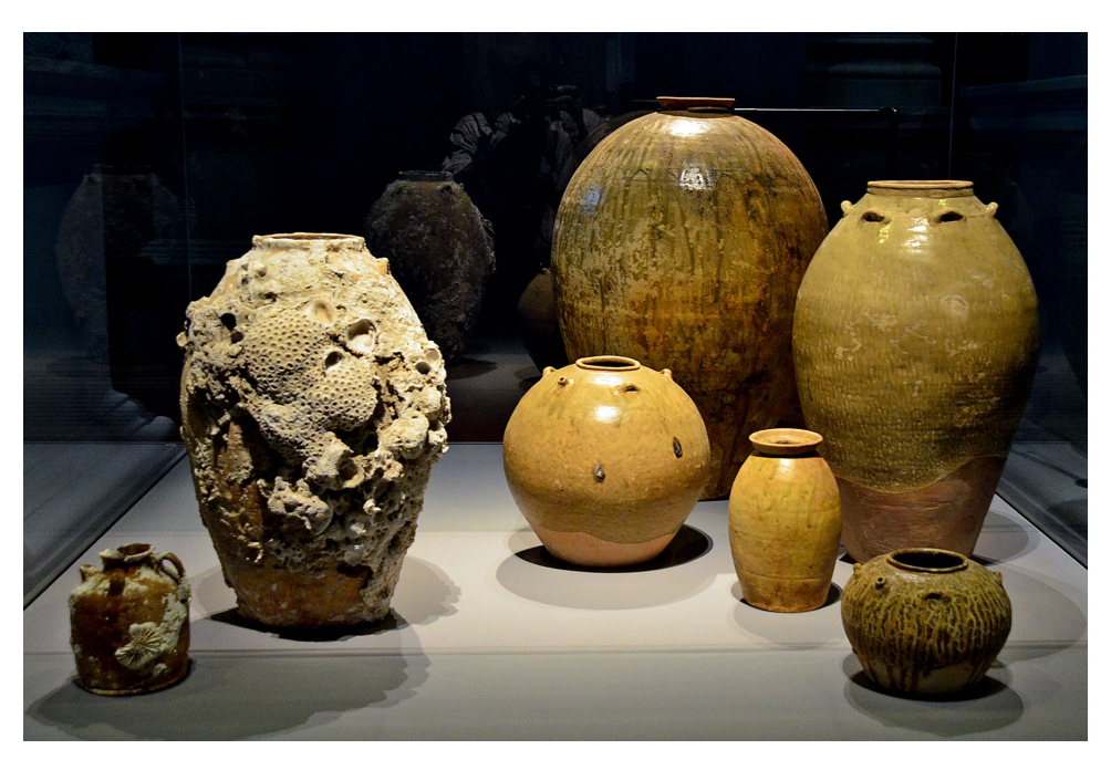
Figure 6: Guangdong greenware storage vessels of various sizes recovered from the Belitung wreck, Asian Civilizations Museum, Singapore.