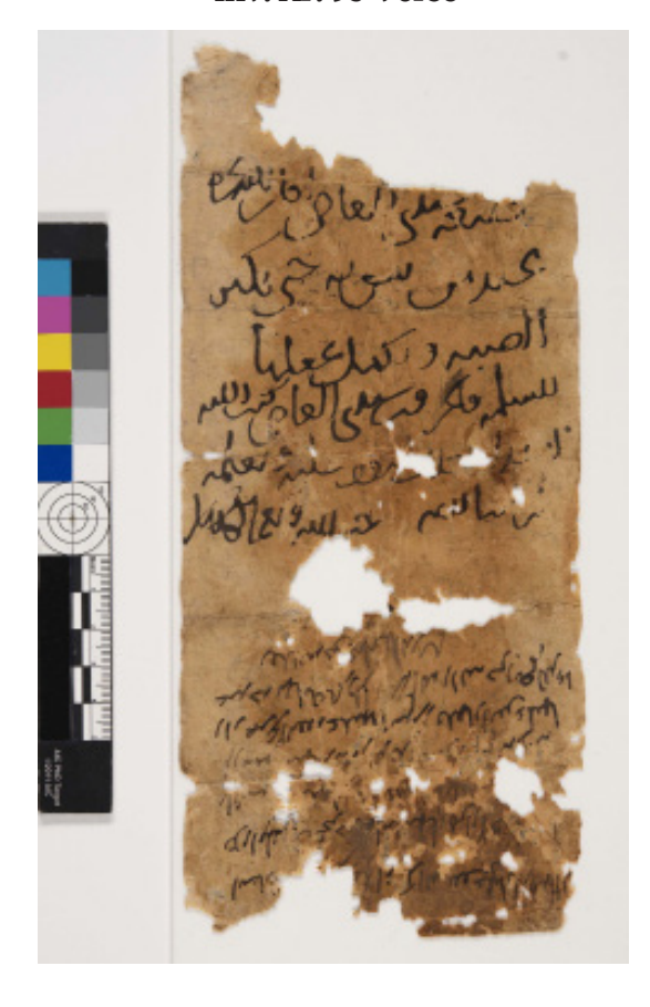
Figure 2: P. Washington Libr. of Congress Inv. Ar. 95 Verso