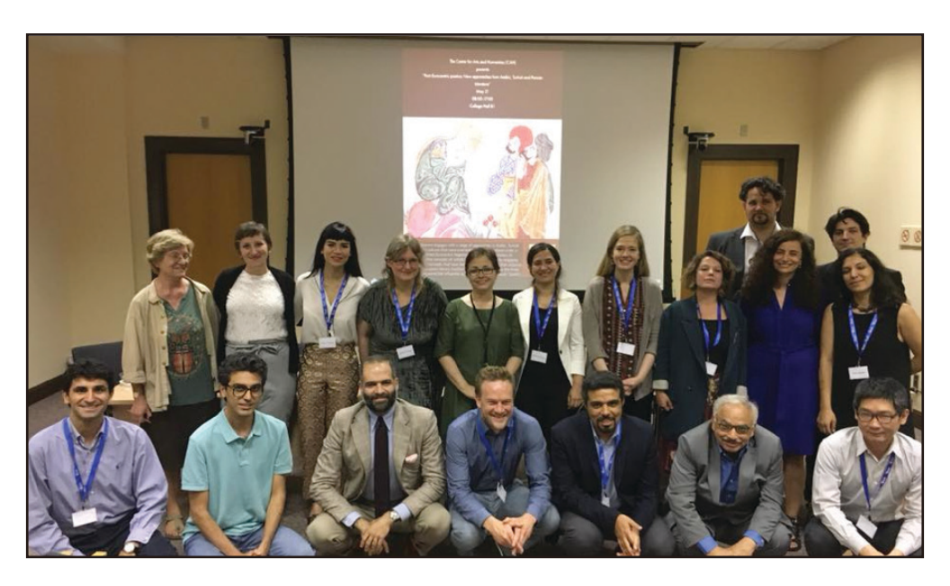
Conference participants at the American University of Beirut, Lebanon, 2018.