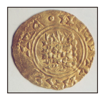
Figure 15. Bilingual Mancus (RAIMVNDVS COMES). Gabinete Numismático de Barcelona 15151.

The mancuses that imitated Yaḥyā's coinages, and probably others as well, traveled to places as far away as Kiev, in Old Russia (Rus), thus becoming material evidence of