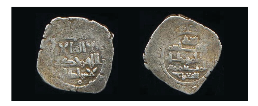
Figure 13. Type Ariza Qā25.1. Dirham, 410, Madīnat Fās . Tonegawa Collection.

Given that these were coined in Fez, perhaps what they show is a lack of prudence on the part of those who recognized him.