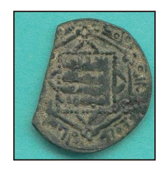
Figure 10. Type Ariza IdII10.1. Dirham, 446, al-Andalus. Tonegawa Collection.