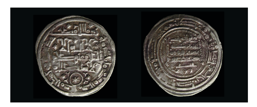
Figure 7. Type Ariza <sup>c</sup>A4.2. Dirham, 407, Madīnat Sabta . Tonegawa Collection.