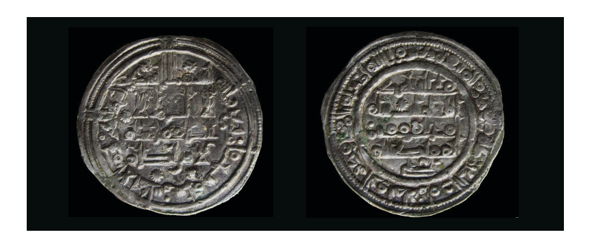
Figure 4. Type Ariza Pre9.4. Dirham, 406, al-Andalus. Tonegawa Collection

Once on the peninsula, ^{c}Al\bar{\imath} captured Malaga, and the coins issued at the al-Andalus mint in the name of Hishām [II], dated 406/1015–1016, must have been the first ones struck in Malaga by the Hammūdids<sup>21</sup> (Fig. 3, 4).