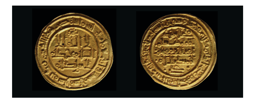
Figure 5. Type Ariza Pre9.5. Dinar, 406 Madīnat Sabta. Tonegawa Collection.