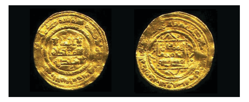
Figure 8. Type Ariza Ya2. Dinar, 413, al-Andalus. Tonegawa Collection

His son, Yaḥyā, in addition to resorting to the stars, introduced the octogram symbol (type Ariza Ya2) (Fig. 8) to the coins. This symbol, besides having legitimizing and propitiatory value, which is closely linked to the symbology of the hexagram, can also be identified with the Rub^c al-Ḥizb. Thus, it made symbolic reference to the "Party of God," to which the Ḥammūdids belonged as noble descendants of the Prophet Muḥammad.³8 Yaḥyā also made use of the symbology of a series of isolated letters ( w\bar{a}w and h\bar{a}^{\prime} ), which, once other possibilities have been ruled out, could very well represent numbers (types Ariza Ya5.1-9, Ya6.1-5) (Fig. 9). Their numerical values, according to the Maghrebi abjad , would be six and eight respectively, which, given their high level of religious significance and their obvious connection with the hexagram and the octogram, could well be regarded as propitiatory value symbols.³9