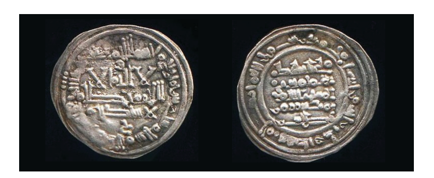
Figure 9. Type Ariza Ya6.2. Dirham, 416, Madīnat Sabta. Tonegawa Collection.

After Yaḥyā, his son, Idrīs [II], would also resort to the octogram (type Ariza IdII10), thus making his intent to carry on with his father's graphic program abundantly clear. This can be understood as an additional element of legitimacy (Fig. 10). As for his own additions, Idrīs [II] added the hexagon to the coin dies (type Ariza IdII10), thus demarcating the legends in the area (Fig. 10), a novelty on both coinages from al-Andalus as well as from the Maghreb that would not be used again in al-Andalus, but that was concurrently used by the Buyids, a