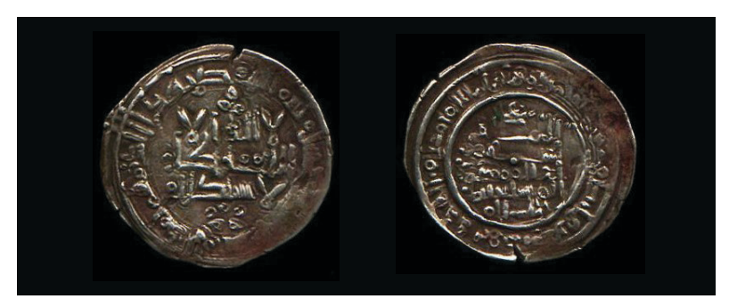
Figure 1. Type Ariza Pre.5.1, Dirham, 405, Madīnat Sabta . Tonegawa Collection.

In that same year, 403/1013, the name of 'Alī b. Ḥammūd appeared for the first time on Caliph Sulaymān's coins.<sup>5</sup> These coins seem to attest to the fact that, during his time in Ceuta, 'Alī was appointed as al-Musta'īn's chamberlain ( h\bar{a}jib ). If we consider the origin and evolution of the appearance of proper names on caliphal coins in al-Andalus, 'in conjunction with the evolution of his name's location on the coin dies (it shifts from the location once reserved for the governors of the Maghreb to the most prestigious space occupied by the great h\bar{a}jib s, Ja'far al-Ṣiqlabī al-Nāṣirī and Muḥammad b. Abī 'Āmir Almanzor), we can hypothesize that not only did 'Alī appear on the coins in his role as ruler of the Maghreb, but also as Sulaymān's h\bar{a}jib ; a hypothesis that could very well be validated by the sources' (Fig. 1).