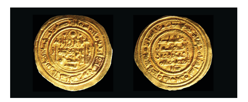
Figure 3. Type Ariza Pre9.3. Dinar, 406, al-Andalus. Tonegawa Collection.

issued in the name of Caliph Hishām [II]<sup>18</sup> (Fig. 3, 4, 5). To some, these issues are proof of the existence of the letter. To others, they are nothing but evidence of its fabrication. This is a central point in the matter of the much-discussed legitimacy of the Ḥammūdid caliphate.<sup>19</sup>