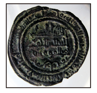
Figure 11. Type Ariza IdII3.1 Dirham, 438, al-Andalus. Tonegawa Collection

Through this monetary symbology, numismatics clearly shows the differentiation of this family branch, which would confront the other branches of the dynasty in the struggle for power (Table 2). The fact that it is precisely this branch that is related to the figure of Sawājjāt al-Bargawāṭī⁴²—known also as Suqqūt—a client of the Ḥammūdids of well-known Shīʿī tendencies, also strengthens the idea that these three caliphs could have been even