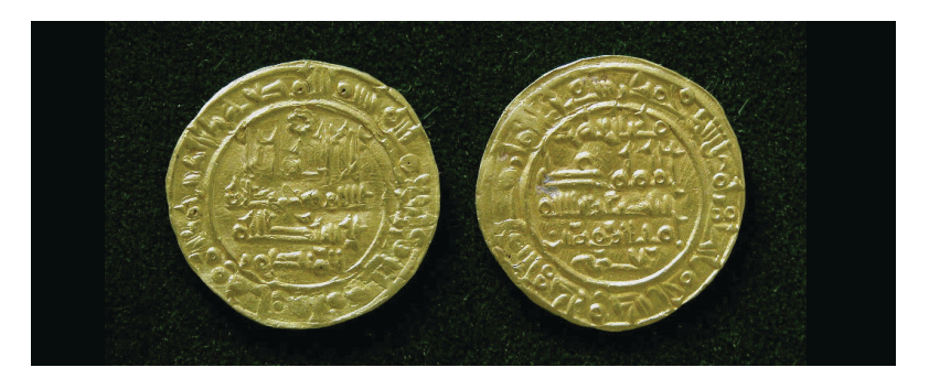
Figure 12. Type Ariza A7.1 Dinar, 407, Madīnat Wahrān.

The caliphate of 'Alī b. Ḥammūd was widely recognized in the Maghreb. Not only does the testimony of literary sources indicate that it was recognized in Tangier, Ceuta and even Fez, but the recently published dinar coined at the Oran mint ( Madīnat Wahrān )<sup>44</sup> in the year 407/1016–1017 (Fig. 12) indicates not only the continuity of caliphal recognition, from the Umayyads to the Ḥammūdids, but that the Ḥammūdid caliphate enjoyed far greater recognition than what had thus far been believed.