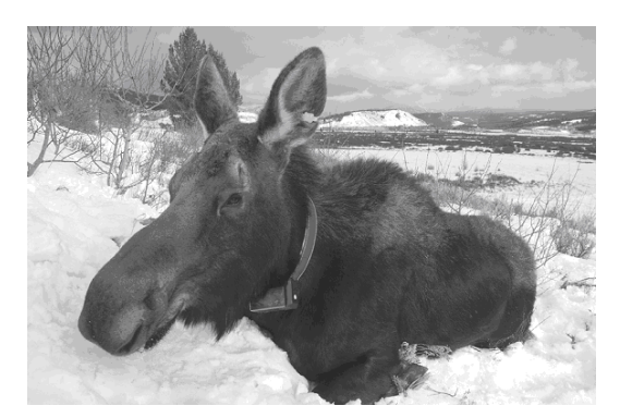
Fig. 1. Shiras moose demonstrating typical sternal posture resulting from immobilization with thiafentanil. This posture reduces the possibility of rumen regurgitation with subsequent aspiration and aids in blood sampling and radio-collar attachment.