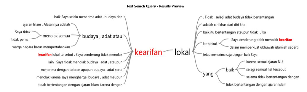
Figure 6. Word Tree of Acceptance of Muslim Students in Local Wisdom

Participants' experiences in respecting local culture and wisdom, data from in-depth interviews with Muslim students in Indonesia are presented in the form of a word tree graph in Figure 6.