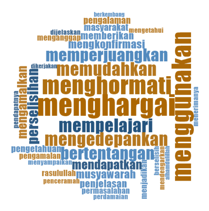
Figure 1. Word Cloud of Student Understanding of Moderate Islam

To explore participants' understanding of Islamic moderation, we need to know how participants imagine Islamic moderation. Participants were asked to describe their experiences as moderate Islamists. We gave participants the freedom to define Islamic moderation based on their Muslim experiences. The definition is given by participants of Islamic moderation collectively consisting of several parameters, which we can then combine or summarize using NVIVO 12 software into a word cloud in Figure 1.