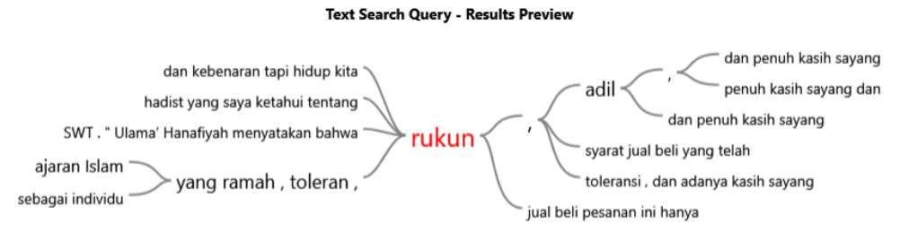
Figure 4. Word Tree of Muslim Students in Tolerance on different religions

In the interview related to tolerance, we expand on tolerance towards adherents of other religions (non-Muslims); the participants shared their experiences.