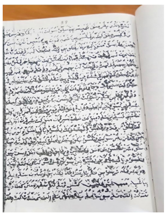
Idahan Manuscript in Jawi Writing

This text is also believed to have been used as a religious book since it contains principles of faith (aqidah) and Islamic jurisprudence (Feqah), and at the time of writing there were no printed books on Islam. According to the owners, the contents of this document are divided into Islamic teachings and matters pertaining to everyday life. From the final clauses of this document it appears that the practice of animism gradually diminished due to the influence of Islam through prayer and matters of faith such as calling to Allah. Matters relating to Islamic teachings in these final clauses are believed to have been communicated by external preachers and were added later to the document.