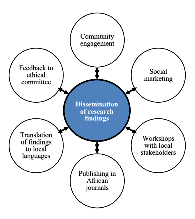
Figure 2: Model of disseminating results

Consultancy agencies should also value the feedback from individuals, groups, and communities rather than making reports to their donors for financial gains. It is evident that some participants now respond to what is needed by enumerators as they do not realise the change and at times take the interviewing process not serious. The social work researchers should be abiding by social research ethics of accountability.