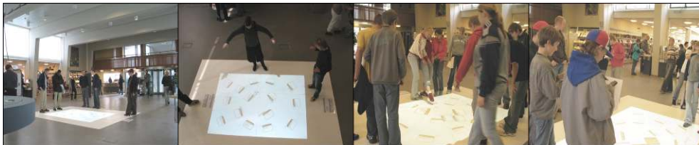
Figure 4: The iFloor in the library.

In the three week period of evaluation and redesign of the prototype at the local central library we learned that the questions posed typically would be in the category of seeking advice or tips and tricks on every day things as, how to un-lock ones mobile phone, or where to find the best and cheapest printer. It came to work at bit like the notice board found in local supermarkets; however, in this case the communication was not about runaway cats and baby carriages for sale but knowledge exchange between users at the library. Furthermore, as the floor was residing in the entrance and exit part of the library it came to work like a "sleeping policeman", causing people to stop and to start chatting about the questions and answers on display, and taking the opportunity to participate in the process by posing new questions and responding to the ones in the display. Furthermore, the playful way of navigating the interface was found very intriguing by the visitors and definitely also facilitated the process of making people talk to one another.