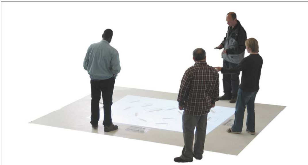
Figure 1: the iFloor in use. Several users discussing and interacting with the floor and the man on the opposite side of the floor is writing a message to the iFloor using a mobile phone