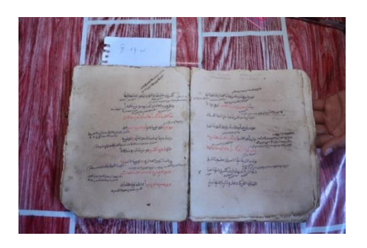
Figure 1. Digitization of 'ilmu al-Nahw Manuscripts of Sijunjung District

The photos above are actually the result of a simple digitization process that researchers have done on five manuscripts in Bukit Gombak, Sijunjung District, West Sumatra. From the photos above, it is clear that the condition of the manuscripts is still in very good condition, without significant physical damage, and can be read with the naked eye. From the photos above, it can be "read" at a glance that the 4