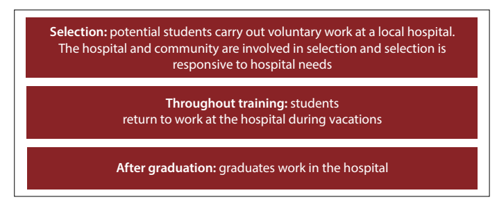
Fig. 2. Involvement of the community in the UYDF model.

of this knowledge, with no requirement of linkage or accountability to their local communities. Results from this study illustrate that the UYDF challenges this process. The UYDF model is seen to act as a catalyst to encourage a tridirectional accountable process between the community, health service provider and IHL.