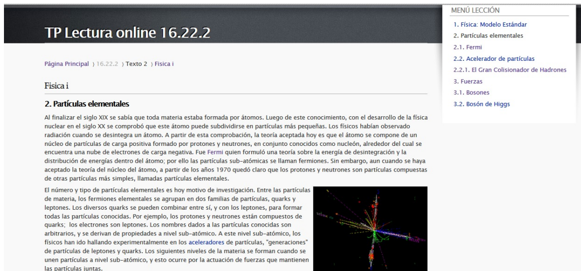
Figure 3. Study 2: Example of a text page (cropped)

Attentional inhibition task: Visual search from the computerised cognitive self-regulation battery ( tareas de autorregulación cognitiva [TAC] ; Introzzi, Canet Juric, Montes, López, & Mascarello, 2015) was employed. Based on the Treisman and Gelade (1980) paradigm, participants had to indicate if there was a target (blue square) or not in an array of distractors (red squares and blue circles) varying in quantity. The perceptual inhibition index was calculated as the performance difference between the 32 and 16 distractor sets: higher scores evidence less efficient interference control on a perceptual level.