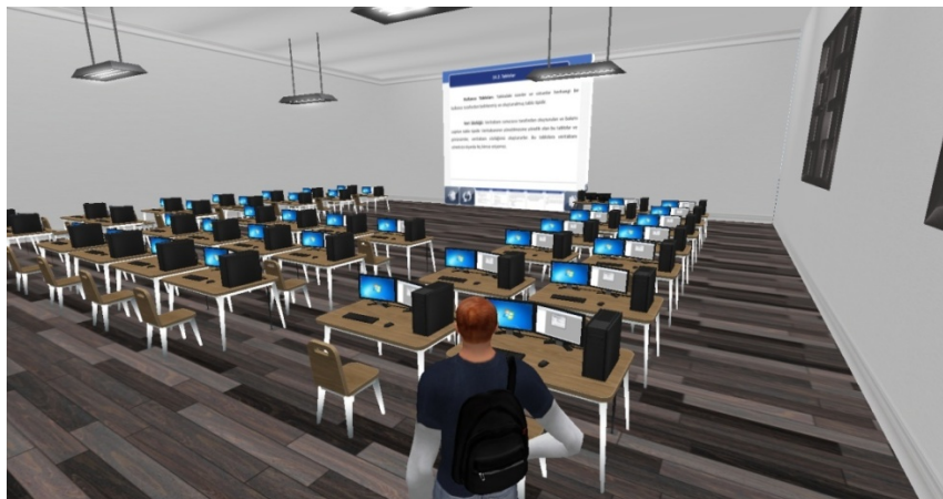
Figure 1. Lab on SL environment

The only difference between the two groups was the learning environment: the experimental group attended the course through SL, while the control group took the same course through the Enocta LMS/Adobe Connect. The SL learning environment was created collaboratively by a designer and the researchers. First, a 65,536 m2 island in SL was secured. Next, the learning environments were designed. All objects were 3D, and the environment included: (a) a virtual school building (Figures 1 and 2); (b) a canteen (Figure 3); (c) a garden (Figure 4); and (d) a contest area (Figure 5). Finally, the overall environment was checked by the researchers and any necessary corrections were made by the designer.