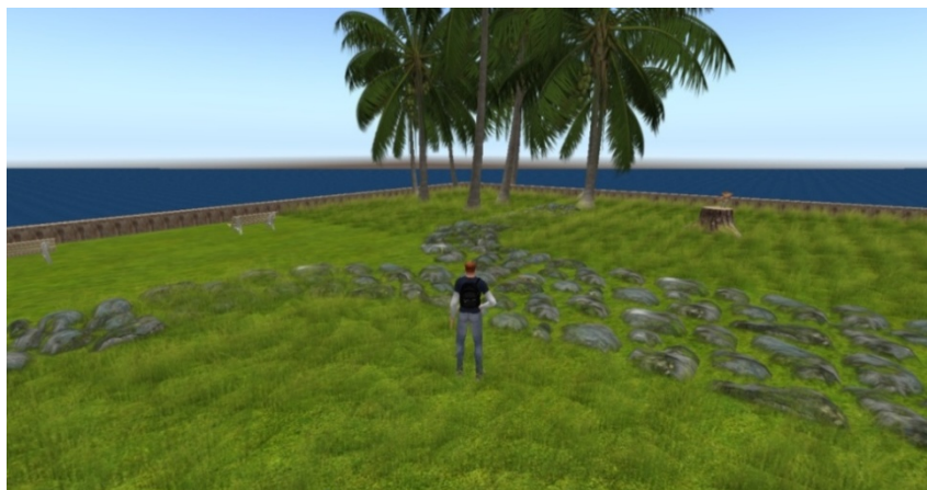
Figure 4. Garden on SL environment