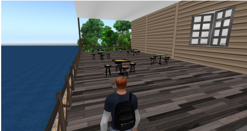
Figure 3. Canteen on SL environment