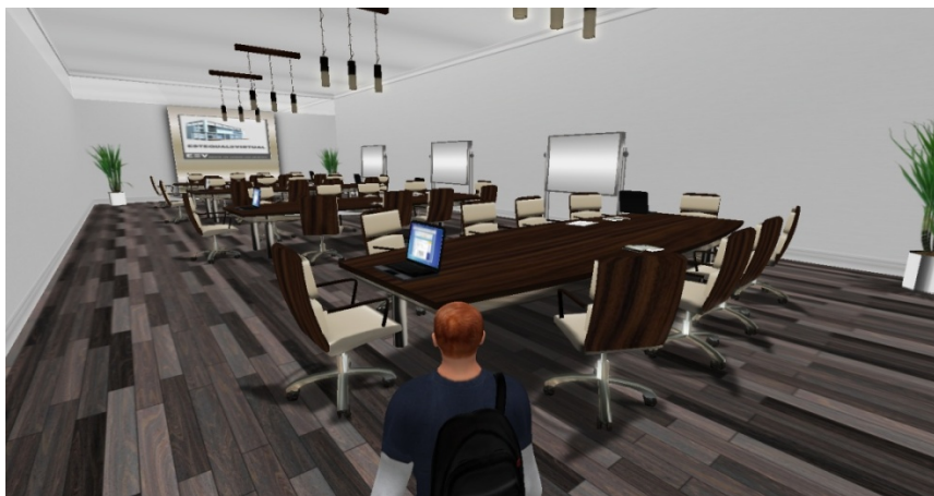
Figure 2. Group work room on SL environment