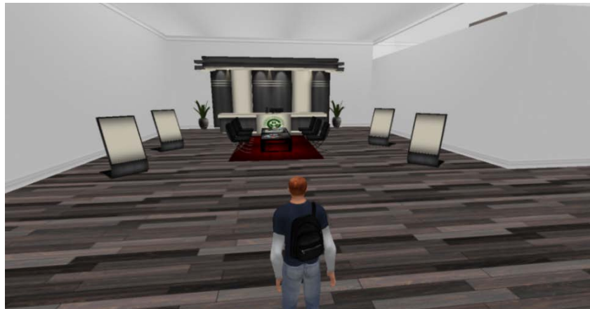
Figure 5. Contest room on SL environment

The second learning environment, made by Enocta, an LMS that helps institutions manage their educational and development projects by assessing whether they continue in accordance of defined goals. The Enocta LMS can be used for face-to-face education, e-learning, or blended learning. (Figures 6 & 7)