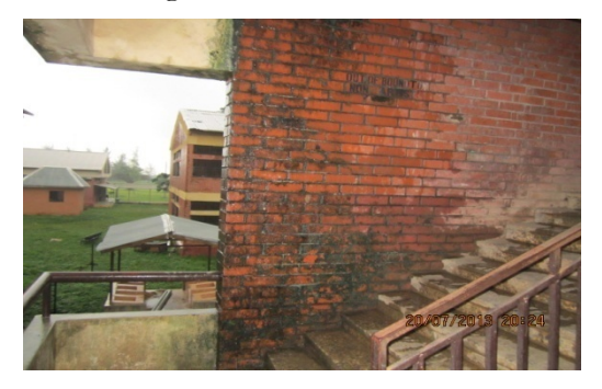
Figure1: Wall dampness during rainfall

cement and sand mortar bed joints. The doors are in timber joinery either flush or panel type, while the windows are in glass and aluminium, sliding or projected. The floors are mainly finished with PVC tiles, terrazzo and ceramic tiles on screeded bed. The sanitary appliances and fittings are ceramic wares connected with PVC pressure pipes. The walls of the sandcrete block structure are plastered and rendered in cement and sand, painted with emulsion paints (see Figure 1 and 2). The buildings are predominately roofed with asbestos or aluminium sheets. The average age of most of the buildings and facilities in the school is 15 years, except for the newly constructed buildings.