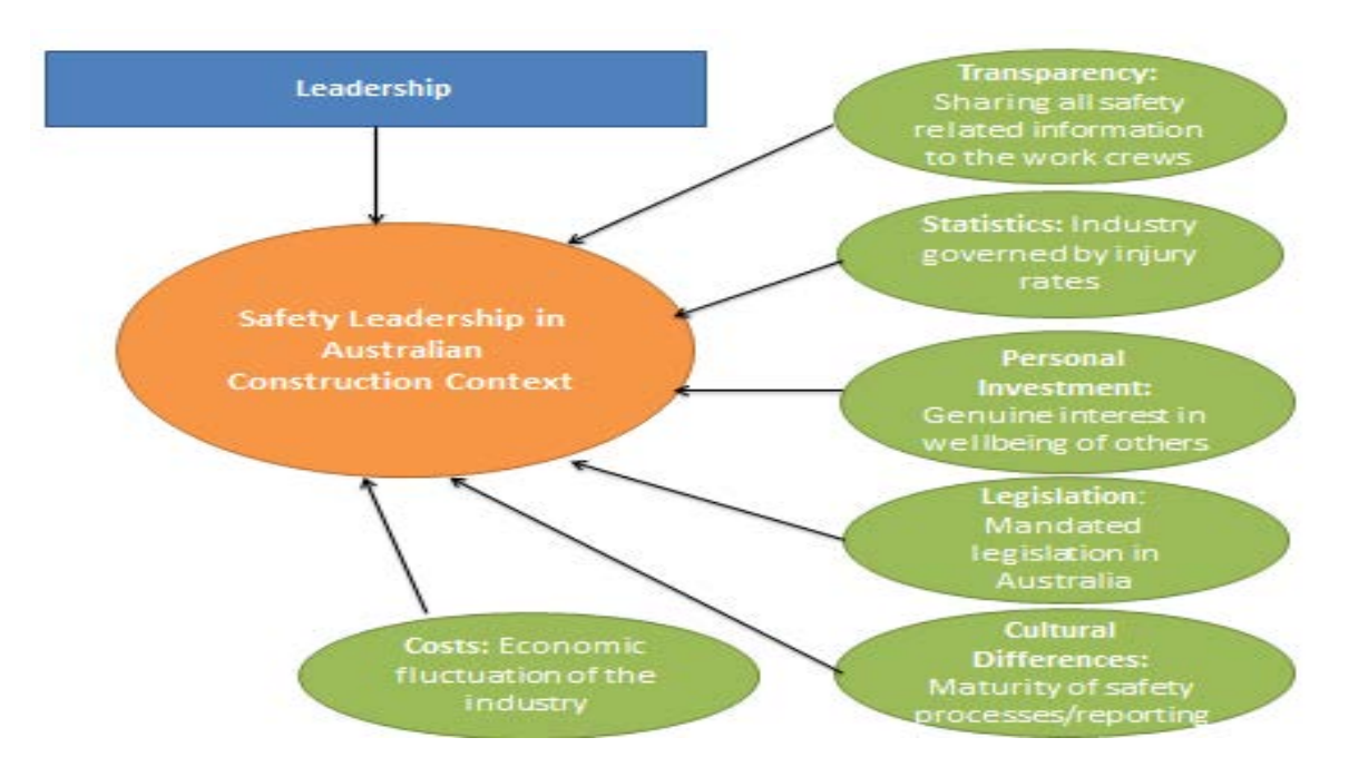
Figure 3: Context of Safety Leadership within current Operating Environment

When there is a safety process that identifies names for safety non-conformances, employee trust and engagement may be adversely impacted (Geller, 2008). Findings in this research outlined that safety leadership is most apparent in the field and is something that can be easily demonstrated. This context of safety leadership as a separate branch of leadership has been graphically represented in Figure 3 which has been based upon the core themes obtained from the data collected.