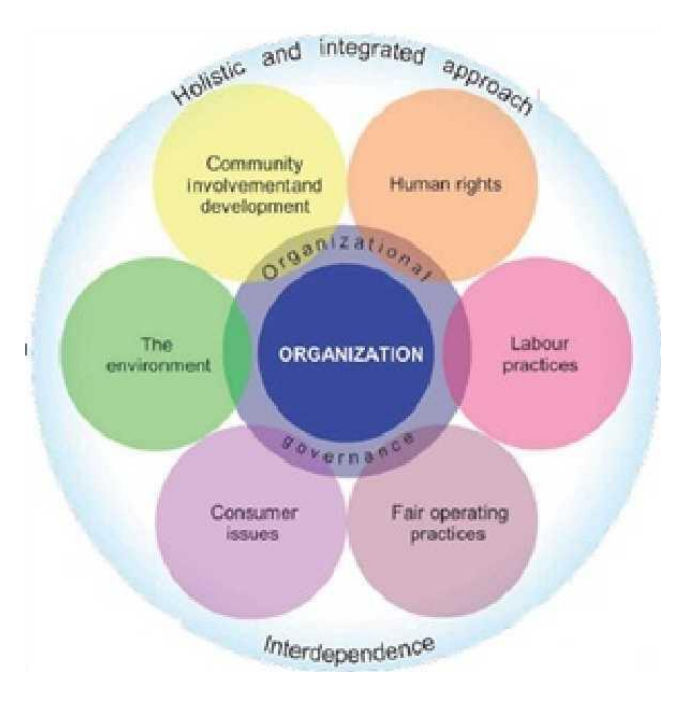
Figure 1 The inter-relationship of Seven Core Subjects (ISO 26000, 2010, p 20)

ISO 26000 (2010) was qualified as being "not a management system standard [nor] intended or appropriate for certification purposes" (p. 1) and further defines SR broadly by reference to seven principles, seven inter-related core subjects and their 36 related SR issues (pp. 10-68), as shown in figure 1.