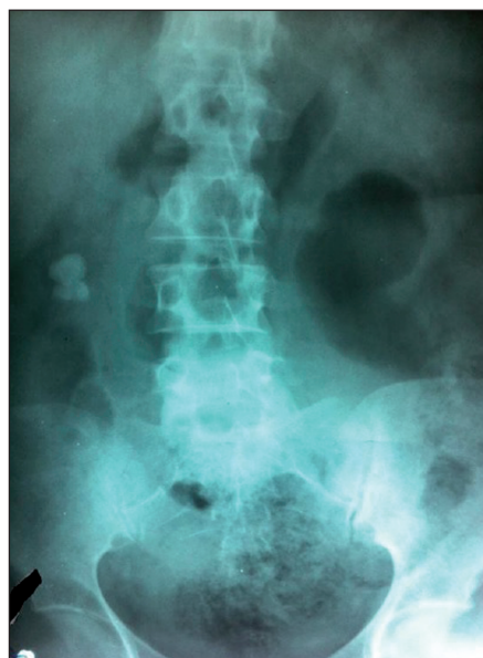
Figure 1. Plain radiograph of the renal stone before PNL operation.

The stone was found in the vesicouterine pouch and extracted (Figure 3). After the operation the patient was discharged without complications at the fourth postoperative day.