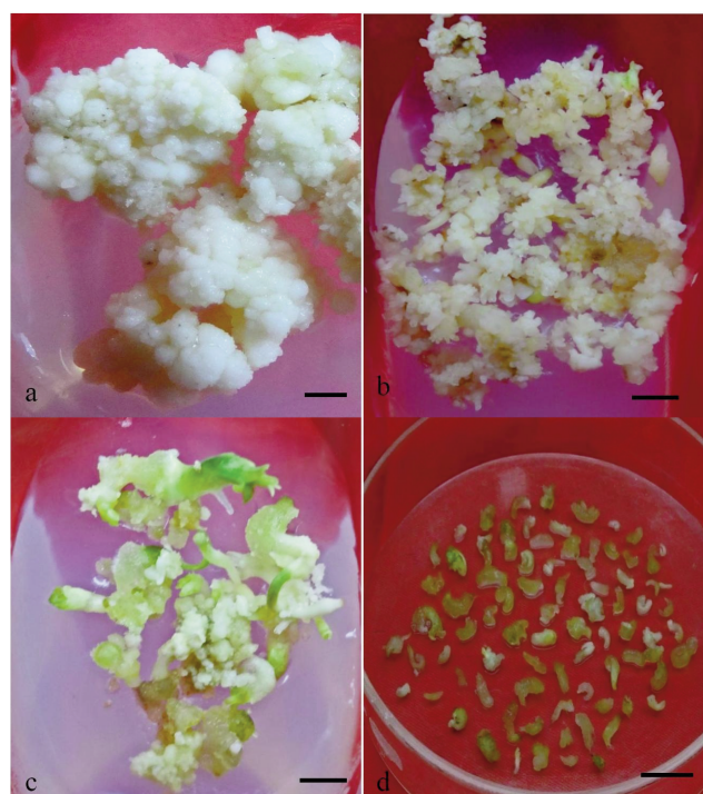
Fig. 1 - Somatic embryo formation in Coriandrum sativum (RS). a) Globular embryos at induction stage; b) Somatic embryos at proliferation stage; c and d) Somatic embryos at maturation stage (scale bar, a=2 mm; b-c= 3 mm; d=1 cm).

added MS but the induced callus was non-embryogenic in nature. The 2,4-D induced embryogenic callus was white and friable, which produced globular embryos on the same induction medium (Fig. 1 a). Of the different 2,4-D concentrations used, 1.0 mg/l exhibited higher embryogenic ability (77.6%) in RS with 63.3 somatic embryos; in Co-1, the embryogenic ability was also equally high (72.8%) with relatively lower numbers of embryos (51.0) (Fig. 1 b). Beside 2,4-D, other PGR combinations were also tested for embryo differentiation. In 0.5 mg/l NAA + 0.25 mg/l BA amended medium, maximum differentiation of embryos (78.7% in RS and 74.0% in Co-1) was noticed (Fig. 1 c-d) and in increasing NAA concentrations the embryo differentiation decreased. The somatic