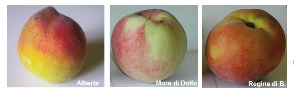
Fig. 1 - The peach old local varieties 'Alberta', 'Mora di Dolfo' and 'Regina di Bember' (originally 'Regina di Weinberger').

Mean \pm SEM. Within each variety, asterisk indicates significant differences between years by Student t -test ( P \le 0.05 ).