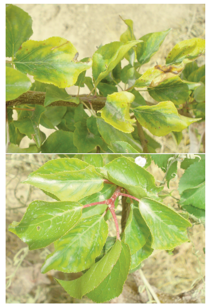
Fig. 2 - Yellowing observed in an apricot accession during sample collection in a National Collection Centre.

All apple and pear plants analysed (180 samples) resulted free from ACLSV, ApMV, ASGV and ASPV. Symptoms such as yellowing, leaf distortion and puckering were observed in some stone fruit plants during collection of the 5521 samples that were tested by DAS-ELISA (Fig. 2). Among them, 23 (0.4%) samples collected from several MSNs in Kabul, Khandahar, Parwan, Herat and Baghlan provinces resulted positive to ACLSV. In particular, there were two plants of European plum (Clone 364/local name Alu BokharaShalili), one cross of Myrobalan and Japanese plum (4031/Grangej Zard), 17 plants of peach (five from 804/Turki Sorkh, five from 812/Dir Ras and seven from 811/TurkiZard), one plant of almond (159/Sattarbai Bakhmali) and two plants of apricot (373/Shakarpara and 4037/Aqa Banu). Two (0.03%) almond samples, both collected from the NCC in Balkh province, resulted infected by ApMV; in was interesting that one of them also tested positive to PNRSV. Analyses against PNRSV evidenced 38 samples (0.6%), collected from NCCs or MSNs located in Balkh, Herat, Kabul, Khandaharand Paktya as infected by the virus (13 almond, five plum, nine peach, and 11 cherry plants). Finally, one plum sample (cv. Alu Bokhara Shalili), from a MSN in Kabul, resulted infected by PDV while none of the stone fruit samples tested resulted positive to PPV (Tables 2-6 and Fig. 3).