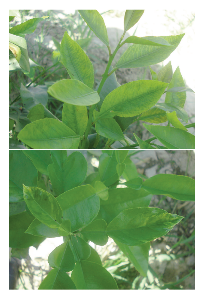
Fig. 4 - Vein clearing and yellowing symptoms observed in citrus accessions collected from the National Collection Centre in Jalalabad (Nangarhar province).

In particular, regarding ACLSV isolates, a 677-long nucleotide fragment, corresponding to partial coat protein gene, was amplified from all ELISA-positive samples by RT-PCR using ACLSV sense and antisense primers (Menzel et al., 2002). Eleven of the identified isolates of ACLSV were then characterized molecularly. Sequence analysis revealed similarity ranging from 83.6 to 100.0% within ACLSV isolates detected in Afghanistan. Blast analysis showed that sequences of two peach isolates, 812/Dir Ras, shared the highest nucleotide similarity (95.8 and 96.2%) with the GenBank ACLSV isolates Apr 3 from Jordan (AJ586631). Moreover, the same Afghan isolates showed nucleotide identity between 95.0 and 95.7% with isolates S4, PP23, PP63, and HL2 (JN849008, GU327991, GU328003 and GQ334211, respectively) from China. Sequence analysis of isolate 364/Alu