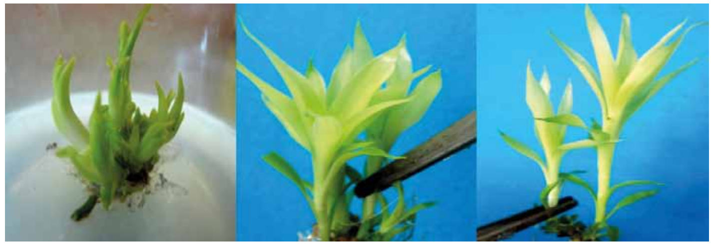
A. First subculture