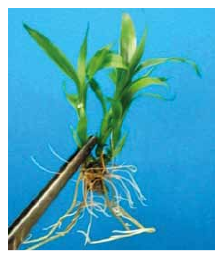
Fig. 2 - Shoots rooted on ½ MS medium containing 2 mg l<sup>-1</sup> IBA, 30 days after culture.

Concentrations of 1 mg l^{-1} BA and 0.25 mg l^{-1} NAA produced the highest number of leaves (8.80) compared to other treatments. Average stem diameter was greatest (5.17 mm) at the concentration of 2 mg l^{-1} BA and 0.5 mg l^{-1} NAA. Chlorophyll content in the treatments with 2 mg l^{-1} BA and