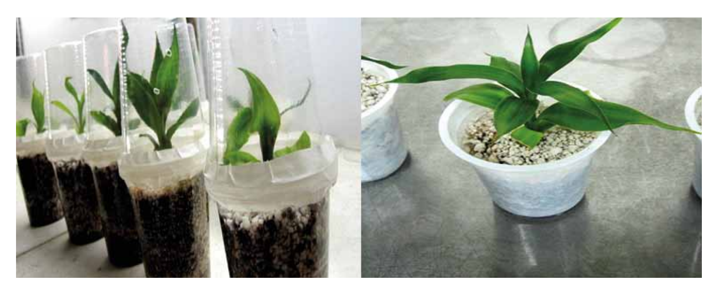
Fig. 3 - 'Green' plantlets transferred to the pots.

<sup>(2)</sup> In each column, means followed by the same letter(s) are not significantly different using LSD test at 5% level.