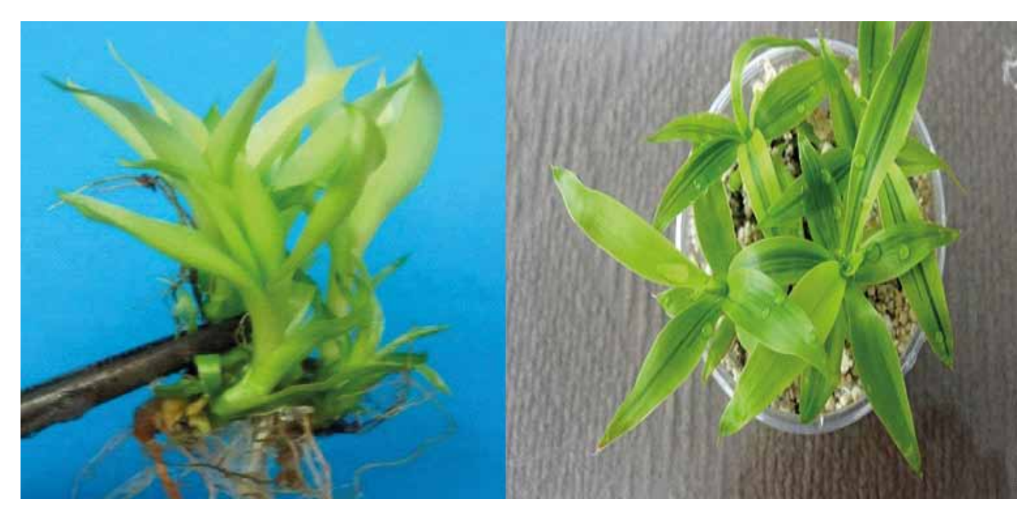
Fig. 4 - Acclimated 'Variegated' plantlets.

<sup>(2)</sup> In each column, means followed by the same letter(s) are not significantly different using LSD test at 5% level.