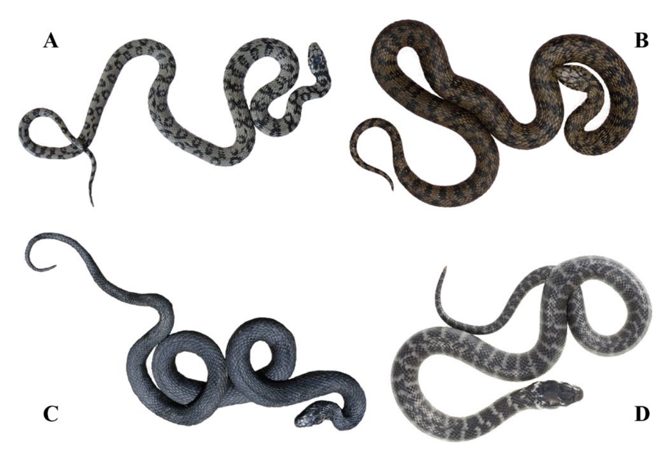
Fig. 1. The four different dorsal colourations of Natrix natrix cetti reported in this study: A) greyish, B) greenish-brownish, C) black, D) the juvenile.