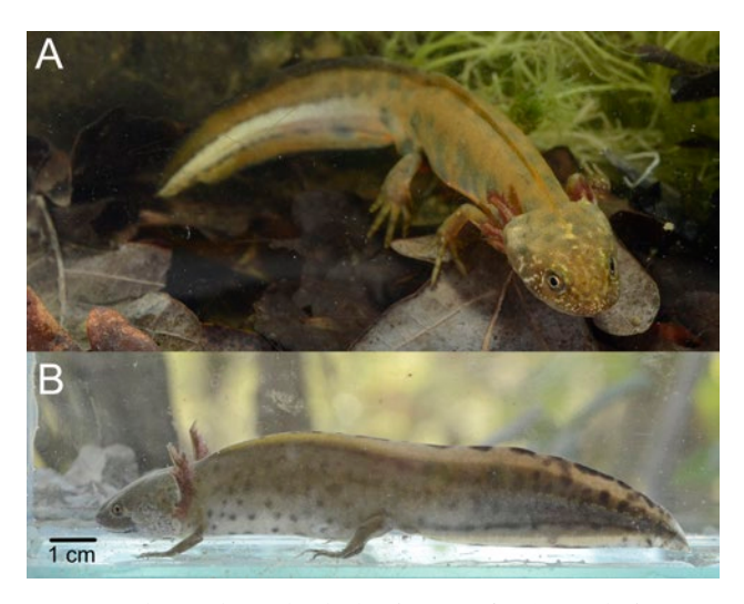
Fig. 1. Paedomorphic individuals of T. carnifex . (A) Male from SF; (B) Female from AN. Scale bar refers only to picture B.

persion to other breeding sites, thus preventing gene flow and giving rise to inbreeding phenomena (Whiteman, 1994). However, facultative paedomorphosis is a plastic process and paedomorphic individuals are able to metamorphose in the presence of challenging environmental conditions like desiccation (Denoël, 2003).