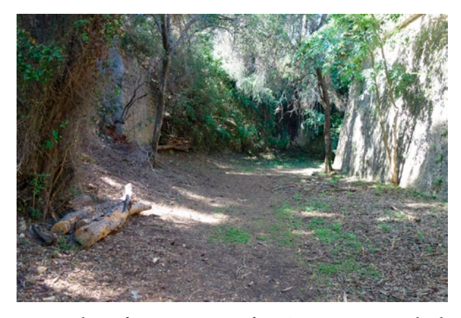
Fig. 2. Habitat of Anguis veronensis from Sainte-Marguerite Island, southeastern France.