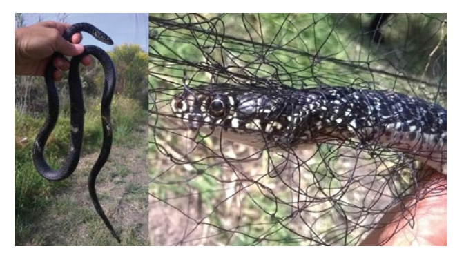
Fig. 2. The specimen from Ventotene island (RL79). The individual was found stuck in a mist net trap and later released.

Interestingly, the four specimens from the Pontine Islands showed a colour pattern which resemble the "abundistic" morph, which is in the middle between the "carbonarius" (melanic/melanotic) and the "viridiflavus" (black and yellowish) colour patterns. The "abundistic" phenotype was previously reported only in Sardinia, Corsica and the Tuscan Archipelago. However, Schätti and Vanni (1986) reported similarities between specimens from the Pontine Islands and the dark coloured ones from Emilia Romagna now considered belonging to H. carbonarius. In particular, the individual sampled from Ventotene (RL79, Fig. 2) had a very dark dorsal with