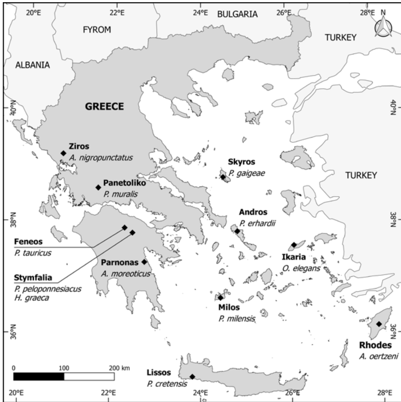
Fig. 1. Map of the collecting sites in mainland and insular Greece, NE Mediterranean Basin.

(1997). Since body temperature may affect caudal autotomy (Bustard, 1968; Daniels, 1984), lizards were allowed to thermoregulate for two hours in a specially designed terrarium (100 × 25 × 25 cm) with two ice bags at one end and two heating lamps (100 W and 60 W) at the other end that provided a thermal gradient ranging from 10 to 50 °C (Van Damme et al., 1986). After achieving its preferred body temperature, each lizard was placed in a terrarium with cork substrate in order to maintain good traction during predation simulation. We used a pair of calipers to simulate the bite of a preda-