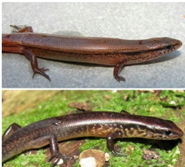
Figure 1. Above, Scincella assata from “La Sepultura” Biosphere Reserve (Chiapas, Mexico). Below, S. cherriei from “Montes Azules” Biosphere reserve, Selva Lacandona (Chiapas, Mexico).

Here, we describe karyotypes of Scincella assata and S. cherriei and provide comparative cytogenetic analysis of these and related taxa. Specimens were identified on the basis of cephalic lepidosis and body coloration (Cope, 1864; Stuart, 1940; Kohler, 2008). One male (RCMX 85) and two females (RCMX 86, RCMX 92) identified as S. assata were collected in the leaf litter along a dry small stream in a dry tropical forest of the “La Sepultura” Biosphere Reserve, Chiapas State, Mexico ( 16^{\circ}20'42'' N, 93^{\circ}50'26'' W), and two males (RCMX 219, RCMX 235) identified as S. cherriei , were collected in the evergreen tropical forest of the “Montes Azules” Biosphere reserve, Selva Lacandona, Chiapas State, Mexico ( 16^{\circ}06'44'' N, 90^{\circ}56'26'' W) (Figure 1). Vouchers are deposited at the Herpetological Collection of the Comparative Anatomy