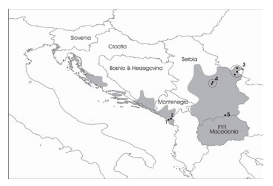
Fig. 1. Map showing the distribution range of T. hermanni in the former Yugoslavia (shaded area) with the numbers referring to sampling areas for the examination of morphological variation (according to Ljubisavljević et al., 2011). 1. Limljani; 2. Starčevo Island; 3. Eastern Serbia; 4. Central Serbia; 5. Southern Serbia.

Morphological parameters were analysed using five samples from Serbia and Montenegro (Fig. 1): 1. Limljani in Montenegro (42°12'N, 19°06'E, 156 m a.s.l.); 2. Starčevo Island in Lake Skadar in Montenegro (42°11'N, 19°13'E, 15 m a.s.l.); 3. Eastern Serbia (localities: Stara Brza, 44°28'N, 22°27'E, 67 m a.s.l.; Petrovo Selo, 44°37'N, 22°27'E, 435 m a.s.l. and Vratna monastery, 44°23'N,