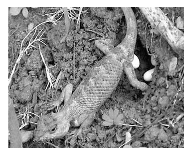
Fig. 1. Calotes versicolor laying eggs in captivity.

Among the captive born lizards that survived for a year or more, 6 of them ( L_1 to L_5 and L_8 ) bred in the 1<sup>st</sup> year between the age of 7-8 months (first breeding season after their hatching), 1 lizard ( L_6 ) skipped breeding in the 1<sup>st</sup> year and bred in the 2<sup>nd</sup> year at an age of 21 months and another lizard ( L_7 ) skipped breeding in the first two years and