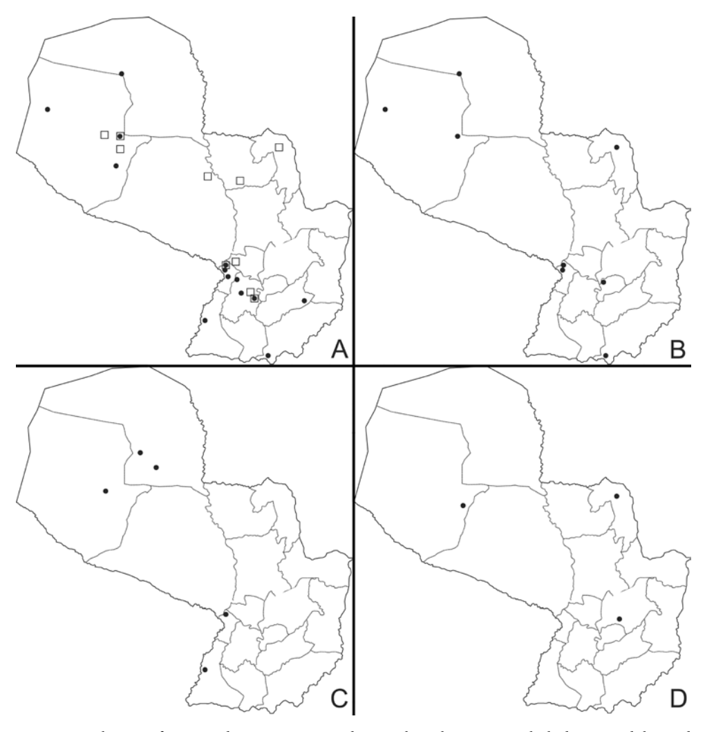
Fig. 3. Distribution of examined specimens, according to the color pattern. Black dots are adults, and open squares are juveniles. Note that there are juveniles only in "A". A: marked pattern, B: slightly marked pattern, C: smooth coloration, and D: banded pattern.

The three specimens were collected from three widely-dispersed localities: Cerro Corá National Park (Cerrado ecoregion, Departamento Amambay), Colonia Walter Insfrán (Alto Paraná Atlantic Forest ecoregion, Departamento Caaguazú), and the surroundings of Loma Plata (Dry Chaco ecoregion, Departamento Boquerón) (Fig. 3D).