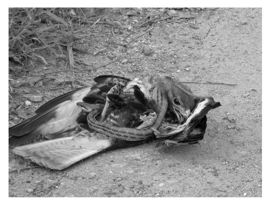
Fig. 1. A Common Buzzard immobilized by a Four-lined snake. Dates and location in the text.

The observation seems to confirm the substantial protection that a large size offer the Four lined snake, when preyed by the Common Buzzard, that, obviously, can prey only young smaller-size specimens of this species.