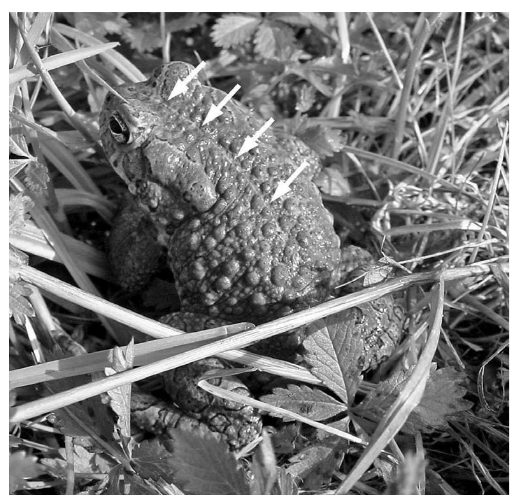
Fig. 3. Specimen of green toad found in the small urban wood "Bosco dell'Osellino" in Mestre, about 6 km NW of Venice, in spring 2008. Arrows point at a well visible, very thin dorsal line.

In the present-day fluid collection of the museum, all what remains of the original material upon which Ninni described the variety lineata can be confidently recognized in five specimens. These are all metamorphosed juveniles (total length = 26.9-30.3 mm), and are preserved in two small jars identified as MSNVE-848 and MSNVE-952 respectively. MSNVE-848 contains 3 specimens and is labelled " B. viridis | v. lineata Nin. | Venezia VII 1879" (Fig. 1a), whereas MSNVE-952 contains 2 specimens and is labelled " Bufo viridis | var. lineata . Venezia" (Fig. 1b). All five specimens are sufficiently well preserved to be