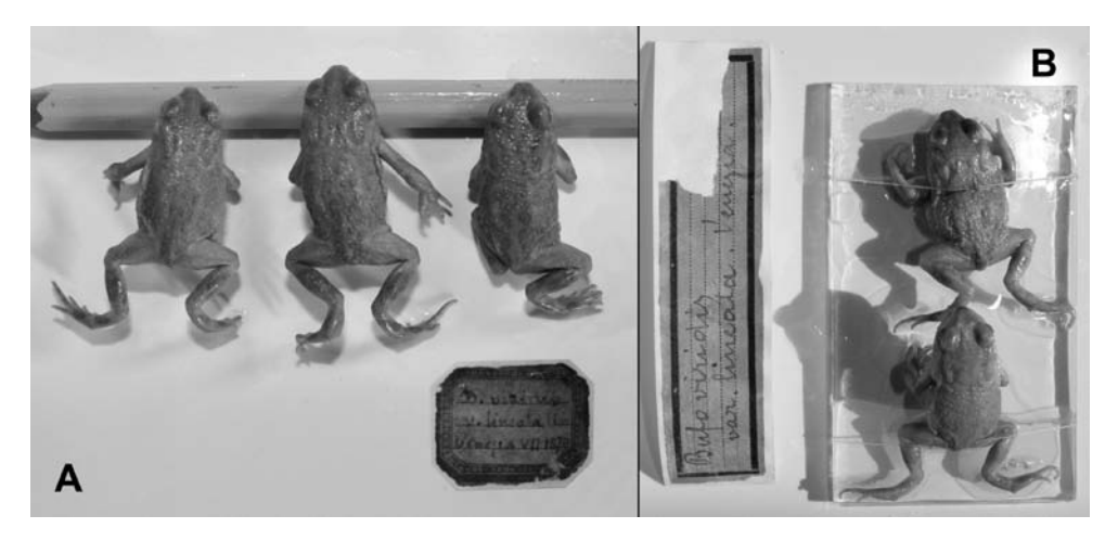
Fig. 1. Specimens of the green toad upon which Ninni (1879) established the variety lineata , from the collections of the Museum of Natural History of Venice (Italy): (A) MSNVE-848, with label " B. viridis | v. lineata Nin. | Venezia VII 1879"; (B) MSNVE-952, with label " Bufo viridis | var. lineata . Venezia.".

balearica – Originally coined by Boettger (1880, p. 642) as "var. balearica" of Bufo variabilis (formerly regarded as junior synonym of B. viridis, but see Stöck et al., 2006, 2008a). Available under the provisions of the ICZN, as it has been introduced following a binomen as a "variety", the author did not expressly give it otherwise infrasubspecific rank (other than as above), neither the content of the work unambiguously reveal infrasubspecific status (ICZN: 45.6.4), and it has been established accompanied by a description (ICZN: 12.1). Moreover, should balearica be demonstrated as originally established for an infrasubspecific entity, it is nevertheless to be considered subspecific from its original publication as it has been adopted as a valid subspecies before 1985 (ICZN: 45.6.4.1). The availability of balearica was already recognized by Stöck et al. (2006, 2008b) and Razzetti (2008). Type material: lectotype: SMF 3722 (formerly: 1297, 1a), paralectotype: SMF 3726 (Mertens, 1967; L. Acker, pers. comm.), in the Senckenberg Forschungsinstitut und Naturmuseum (Frankfurt, Germany). Type locality: Majorca and Minorca, Balearic Islands (Boettger, 1880), restricted to Palma (Majorca, Balearic Islands, Spain) by lectotype designation (Mertens, 1967).