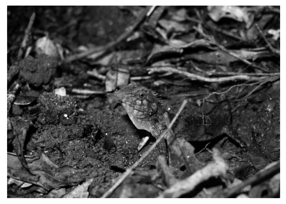
Fig. 1. During the disturbances it expanded its gular sac and looked around.