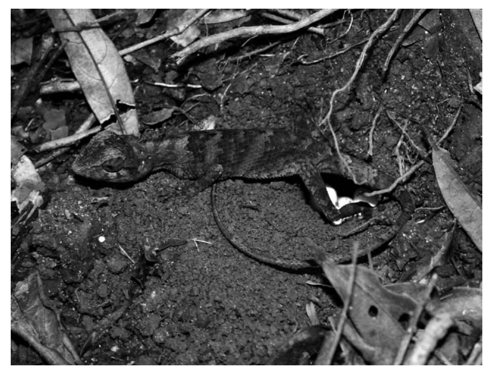
Fig. 2. The lizard laying eggs and see tail is curved.