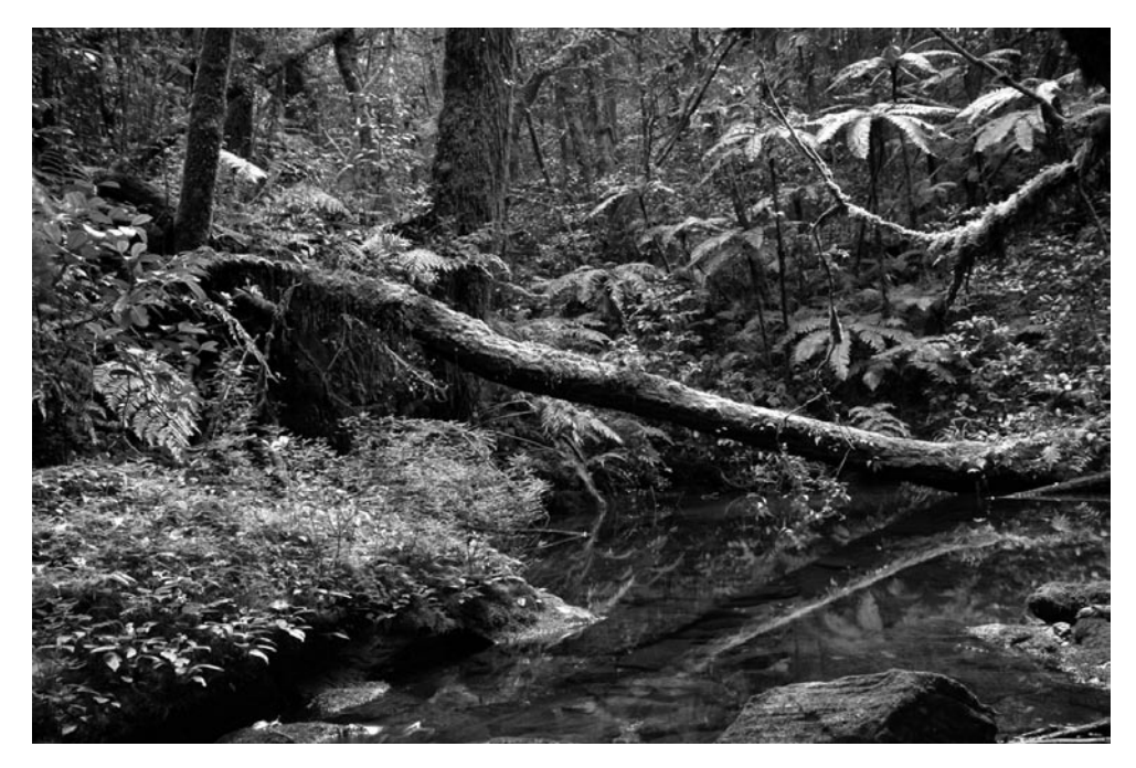
Fig. 2. The montane rainforest of the Nguru South Mountains, one of the sampled habitats.