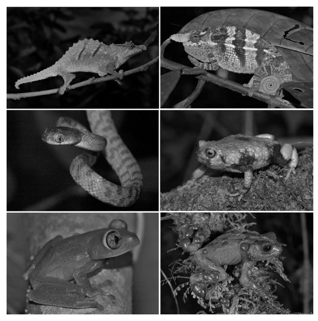
Fig. 3. Some species recorded during the present study. Clockwise: Rhampholeon acuminatus; Kinyongia fisheri fisheri; Dipsadoboa werneri; an undescribed species of Callulina; an undescribed species of Leptopelis and an undescribed giant species of Nectophrynoides .

cardamom. The programme represents an opportunity to reverse the current trend of forest loss and degradation. To succeed the programme will need sustained commitment from the Government of Tanzania, civil society organisations, the local communities and development partners to conserve the unique biodiversity of this area.