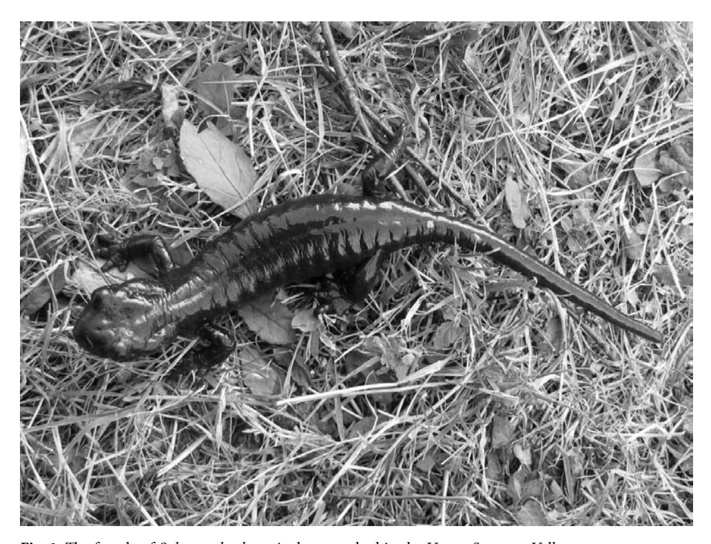
Fig. 1. The female of Salamandra lanzai, photographed in the Upper Sangone Valley.

at 94 °C for 45 s, annealing at 55 °C for 45 s and extension at 72 °C for 90 s, and a final extension of 300 s at 72 °C. PCR products were loaded onto 1% agarose gels, stained with ethidium bromide, and visualised on a "Gel Doc" system (PeqLab). If results were satisfying, products were purified using QIAquick spin columns (Qiagen). The light strands were sequenced using an ABI3730XL by Macrogen Inc. (sequences GenBank accession numbers: EF191028- EF191041). Sequences were manually edited and aligned using the BioEdit sequence alignment editor (version 7.0.5, Hall, 1999).