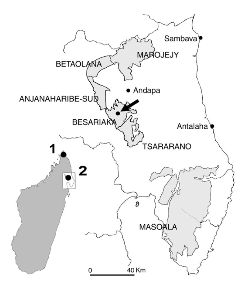
Fig. 1. Location of Besariaka Forest (where the new individual of Uroplatus alluaudi MRSN R1630 was found) and of other forest sites around Andapa, NE Madagascar. The arrows indicates the campsite, while the two points on the smaller map of Madagascar refer to Montagne d'Ambre (1) and Besariaka (2).

This is due to several reasons, among which the use of forest areas for cattle, cutting of trees by villagers, use of path systems, and for hunting (Andreone et al., 2000).