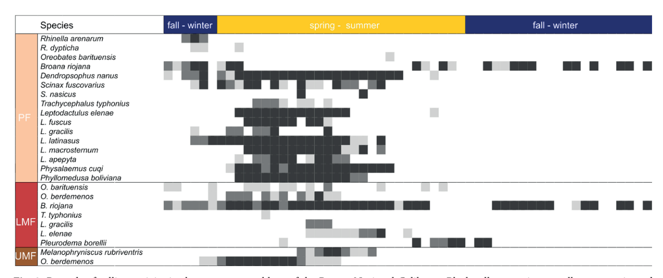
Fig. 2. Records of calling activity in the anuran assemblage of the Parque Nacional Calilegua. Black cells = maximum call events registered (3). Grey cells = medium calling events registered (2). Light cells = minimum callings events registered (1). PF = premontane forest; LMF = lower montane forest; UMP = upper montane forest.

but also with diurnal vocalizations (Table 1, Rayleigh = 0.8; P < 0.0001). Dendropsophus nanus presented a crepuscular-nocturnal vocal activity, with separated activity peaks at 20:00 h, 21:00 h, and 05:00 h (Rayleigh = 0.65; P < 0.0001). Scinax fuscovarius presented a calling pattern mainly crepuscular and nocturnal, with a peak of records at 22:00 h and 06:00 h, but also presented vocalizations