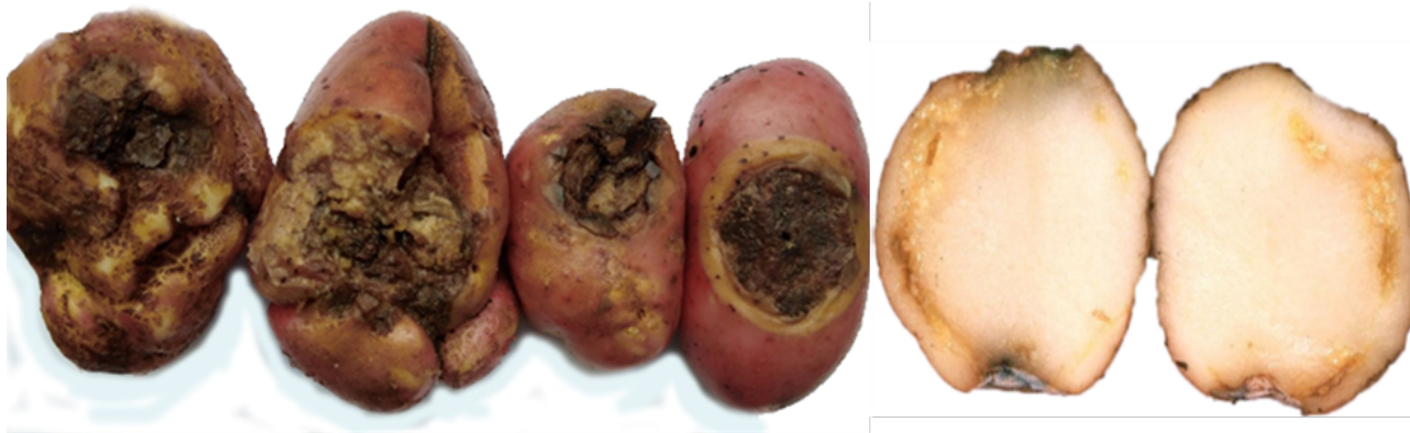
FIGURE 1. Potato tubers (variety Désirée (Red Skin)) infected by the causal agent of the bacterial wilt, Ralstonia solanacearum .

solanacearum were identified in a triphenyl tetrazolium chloride (TTC) medium containing 0.005% TTC (Kelman, 1954).