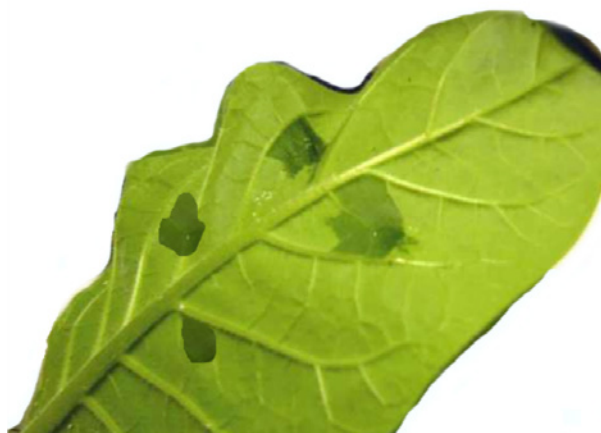
FIGURE 3. Appearance of necrotic spots on the underside of tobacco leaves produced by Ralstonia solanacearum .

To ensure that the isolated strains were virulent, the underside of tobacco leaves was inoculated with a bacterial suspension of R. solanacearum at a concentration of 10^8 CFU ml -1 . After incubation for 7 d, the development of necrotic spots was observed around the infiltration zones (Fig. 3). These findings are consistent with those published by Heikrujam et al. (2020), who discovered that R. solanacearum could produce a hypersensitive reaction in tobacco leaves after 7 d.