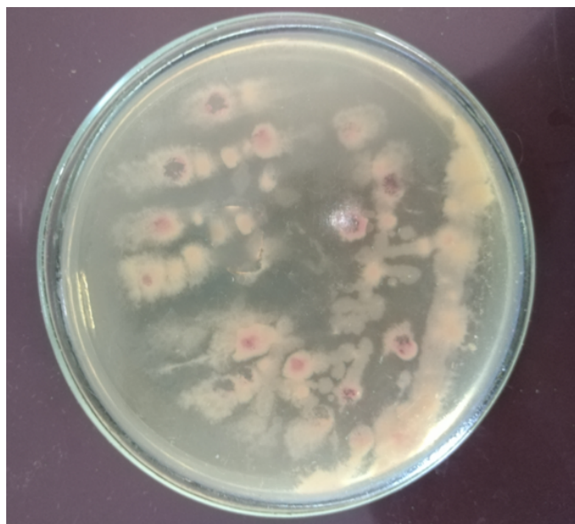
FIGURE 2. Characteristic aspect of Ralstonia solanacearum .

A Kelman tetrazolium chloride (CTC) agar test distinguished virulent from avirulent isolates of R. solanacearum . Additionally, in the TZC medium, these isolates generated pink or light red colonies or colonies with a distinctive red center and a white border (11 isolated strains), whereas avirulent isolates (9 isolated strains) produced tiny, off-white, and non-fluid colonies after 24 h of incubation. The results of this test showed that all R. solanacearum isolates (11 virulent strains) from the five potato tubers had gathered the typical pink or light-red colonies or colonies with a distinctive red center and a white border on