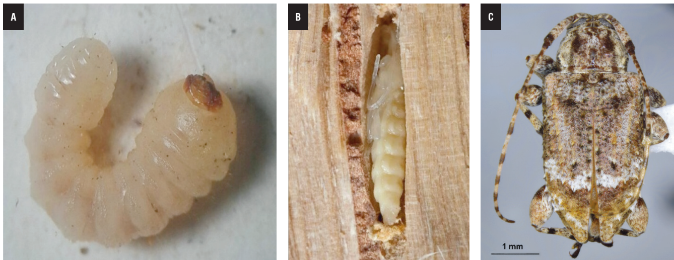
FIGURE 1. Leptostylus hilaris individuals at different stages of development: a) larvae; b) pupae inside the stem; c) adult.

specimen. Additionally, specimens were compared with the ones in the collection of the Museu de Zoologia of the Universidade de São Paulo (São Paulo, Brazil).