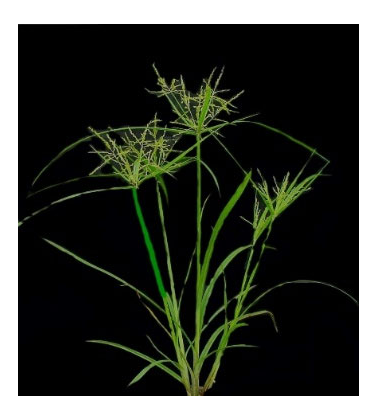
Mimosa invisa L. Oxalis barrelieri L. Cvperus sp Figure 3. Dominant weed species in cassava plantation at Jonggol, West Java, Indonesia.

study by Listyowati et al. (2022), the dominance of broadleaf weeds is due to by the growth of weed seeds after tillage; soil tillage brings the weed seeds to the soil surface and exposed them to light required for germination. The dominant weed species has vine and creeping growth habits, such as Tetracera indica , Ottochloa nodosa , Dioscorea hispida , and Ipomoea obscura . According to Sudira et al. (2017) root system greatly affects plant growth, those with shallow and creeping roots get more nutrients and water, whereas those with taproot can grow deep into the soil to access water.