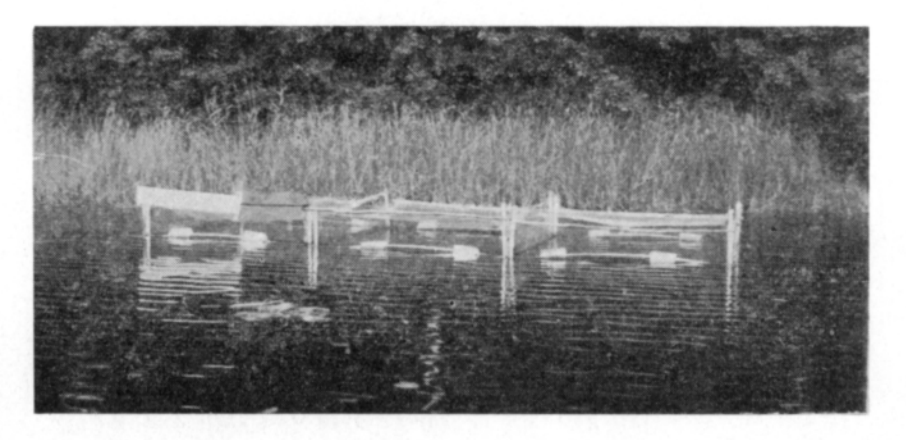
Fig. 1. Trout rearing nets in the feeding trial

The trial was carried out between June 22 and September 15, 1966, at Pornainen in the lake of Vermijärvi at a depth of 2.5 metres (Fig. 1). The temperature of the